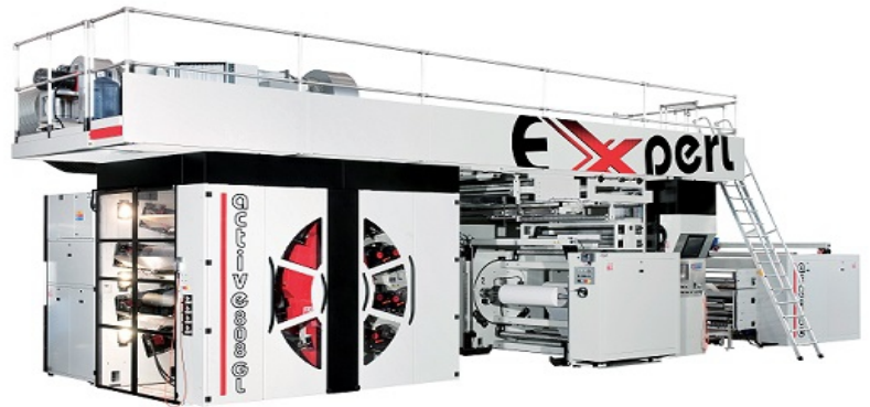
Active From 24" to 55"