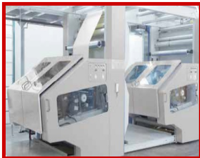
Downstream Units (both Inline & Stack)