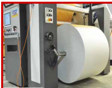
Shafted & Shaftless Unwinders

Expert's Flexo and Converting Solutions are sold and serviced in North America by: