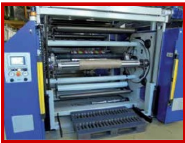
Automatic Flying Splice Rewinder