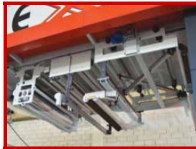
Reprint System for perfecting