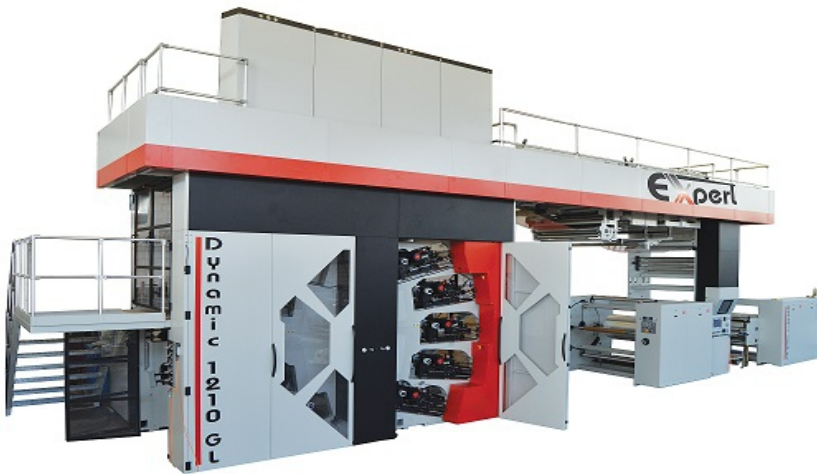
Dynamic From 32" to 80"