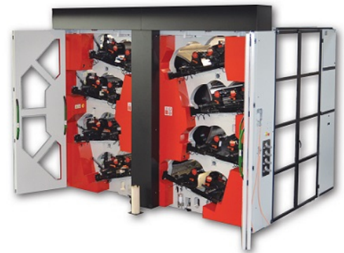
Evolution CI 8 color